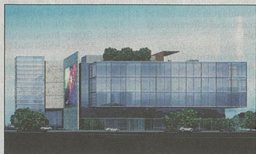
Coming up: Artist impression of DB&B's transitional office building at Scotts Road

Mr Siew explained that as a built-to-suit office